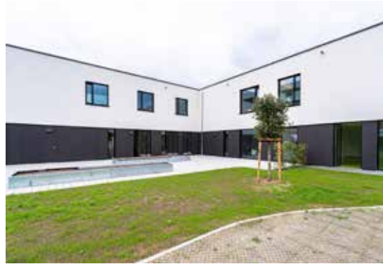
Center for Psychosomatic Medicine & Day Clinic Leonberg

Calw Psychiatric Center – Klinikum Nordschwarzwald