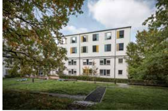
Clinic for Child and Adolescent Psychiatry and Psychotherapy in Böblingen

The clinic for child and adolescent psychiatry in Böblingen has an inpatient area for children ages 4 to 14 and an adolescent ward. The clinic takes care of early detection, diagnosis, therapy, and arranges aftercare if needed.