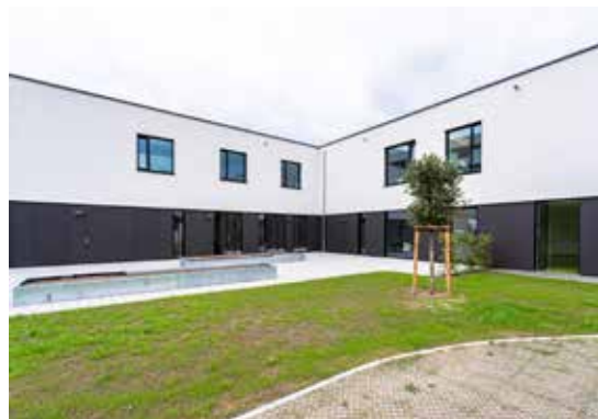
Center for Psychosomatic Medicine and Day Clinic Leonberg