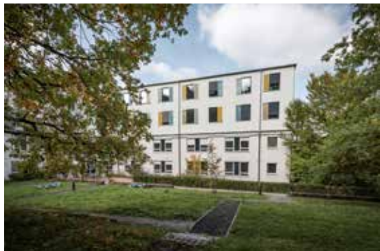
Clinic for Child and Adolescent Psychiatry and Psychotherapy in Böblingen

The clinic for child and adolescent psychiatry in Böblingen has an inpatient area for children ages 4 to 14 and an adolescent ward. The clinic takes care of early detection, diagnosis, therapy, and arranges aftercare if needed.