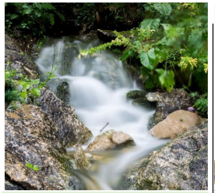
What happens at Mind-Spring: